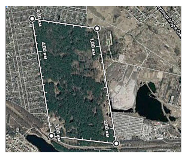
Figure 2. Visualization of the geographical location of the solid waste landfill in the city of Zhytomyr (Ukraine), (https://www.google.com/maps)

side of the landfill site (according to the sanitary passport of the landfill), at a distance of 0.05 km, there is a coniferous forest (Fig. 2). The forest area is about 1,000,000 km<sup>2</sup> (the shape of the plot can be described as a parallelogram with sides of 750 and 1400 meters). On all other sides, the forest is surrounded by country estates without large highways and industrial enterprises, which could distort the picture of the study and further affect the condition of forest plantations.