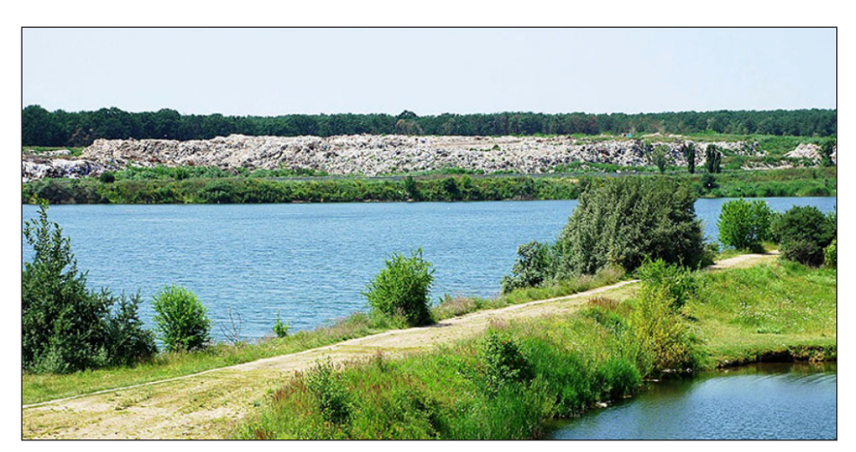
Figure 1. View of the municipal landfill for solid waste disposal (https://www.google.com/maps)

The geographical location of the Zhytomyr solid waste landfill is quite specific and allows for various comprehensive studies: on the western